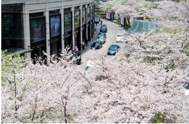
White cherry blossoms on Discovery Boulevard of HKRI Taikoo Hui have become a new photo spot of Shanghai this April