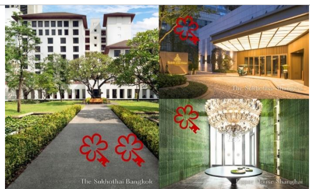
The two hotels under HKRI's hospitality brand "The Sukhothai Hotels & Resorts" were recognised "MICHELIN Key Hotels"