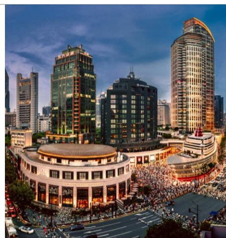
HKRI Taikoo Hui

Underpinned by HKRI's vision for long-term community development, HKRI Taikoo Hui prioritises optimising its tenant mix and future growth, distinct from the traditional short-term return approach. Art curation and VR experiences possess potential in enriching overall offering and entertainment appeal, attracting and retaining a premium clientele. In April, HKRI Taikoo Hui launched two highly anticipated debuts . The global debut of "Paradise Eternal" , a photo exhibition by internationally renowned wildlife photographer Mr. Jeffrey Wu - one of the most influential contemporary wildlife photographers and brand ambassador of "Magical Kenya" - was unveiled. The event was graced by the presence of Princess Marie of Liechtenstein, global ambassador of the Mara Elephant Project. Meanwhile, at HKRI Taikoo Hui, the VERS Immersive Exploration Center by The Multiverse Project welcomed the national debut of "Horizon of Khufu 2: The Secret of the Builders," an immersive VR experience developed by the French immersive VR content studio Excurio. Utilising cutting-edge technology to digitally reconstruct an immersive environment, visitors are transported back 4,500 years to ancient Egypt to explore the interior of the pyramids from a first-person perspective. This marks the first public experiential showcase of its kind since its discovery.