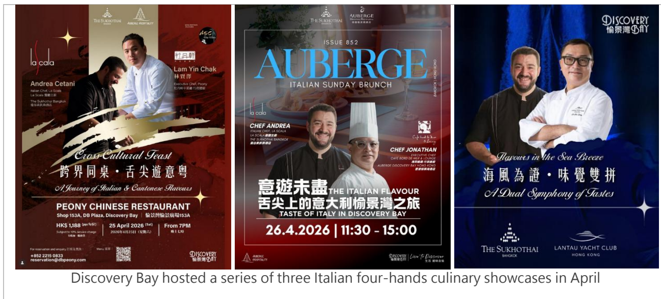
Discovery Bay hosted a series of three Italian four-hands culinary showcases in April