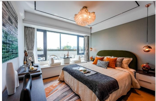
Sienna One fully embodies the high Hong-Kong-developer construction standard