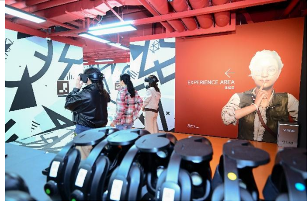
The immersive VR experience “Horizon of Khufu 2: The Secret of the Builders” was unveiled at The VERS Immersive Exploration Center of HKRI Taikoo Hui, sparking a new wave of excitement

Building on HKRI’s values of “Pioneer” and “Innovation”, HKRI Taikoo Hui continues to curate a diverse portfolio of experiential initiatives spanning art, gastronomy, cultural tourism and sports . In April, Discovery Boulevard of HKRI Taikoo Hui was transformed into an immersive cherry blossom-themed promenade, while the South Garden introduced the popular “Angry Molly” large-scale sculpture matrix. In recent years, HKRI Taikoo Hui has established itself as a curator of signature citywide events, including China’s inaugural Michelin Food Festival and creative night markets to boost the evening economy. HKRI Taikoo Hui has also collaborated with leading global artists and art institutions to present large-scale public art installations such as “Pez” the Crowned Little Dinosaur and the “Confetti Rabbit”, as well as multiple editions of the charity public piano art campaign, “Play Me, I’m Yours”.