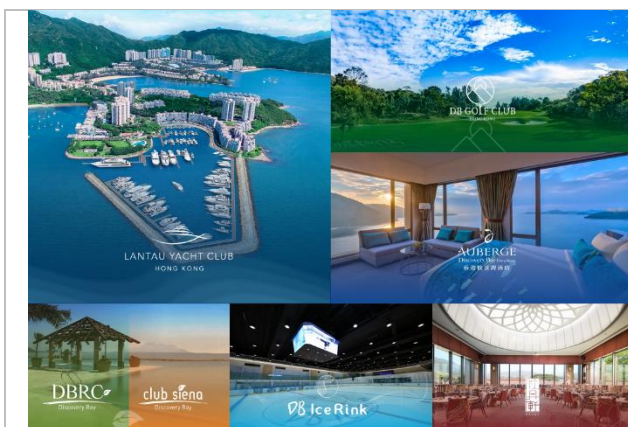
The leisure brands under Auberge Hospitality

Last July, Hotel Kanronomori, located in the renowned Niseko Konbu Onsen area of Hokkaido, Japan, joined the Group's hospitality portfolio, standing alongside Auberge Hospitality and The Sukhothai Hotels & Resorts. Each of HKRI's hotel and leisure brands has its own distinct character, yet all uphold the Group's core value of "Devotion". HKRI has consistently maintained the highest hospitality standards, earning long-term trust of discerning guests. This dedication to service excellence shares the same craftsmanship spirit as the Group's residential and commercial projects, writing a long-term commitment to thrive alongside the cities and the communities.