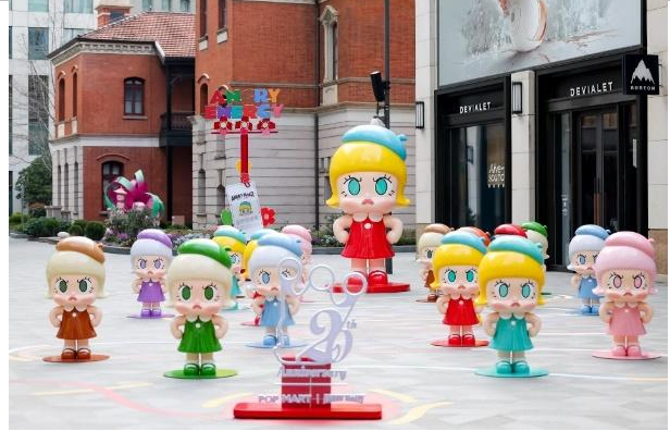
Nearly 20 rainbow-hued fiberglass Angry Molly sculptures have transformed the South Garden of HKRI Taikoo Hui into a giant photo spot for fans