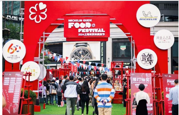
HKRI introduced China's first Michelin Food Festival