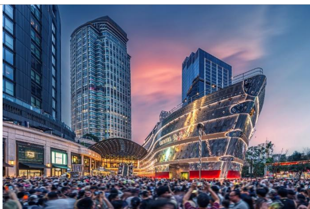
The world's only giant ship-shaped and largest exhibition installation "The Louis" of Louis Vuitton has continued to generate high market momentum since its grand opening

With a total investment nearing RMB18 billion, HKRI's flagship project in the Yangtze River Delta area, HKRI Taikoo Hui, has established itself as a premier trendy luxury fashion landmark. Located in the prime Nanjing West Road Business District of Shanghai, HKRI Taikoo Hui integrates experiential retail, premium office towers and boutique hotels. HKRI Taikoo Hui has consistently elevated its tenant portfolio through brand enhancement, introducing over 20 China-first stores alongside more than 30 global flagship and concept stores in the past three years. Since launching the "2.0 Upgrade" in 2022 to optimise traffic flow, HKRI Taikoo Hui proudly introduced Louis Vuitton's "The Louis", the world's only giant ship-shaped and largest installation exhibition, in June 2025. During its inaugural weekend, HKRI Taikoo Hui welcomed nearly 200,000 visitors, driving double-digit year-on-year growth in revenue across the Nanjing Road West Commercial District, as well as generating over 16 billion cumulative social media engagements.