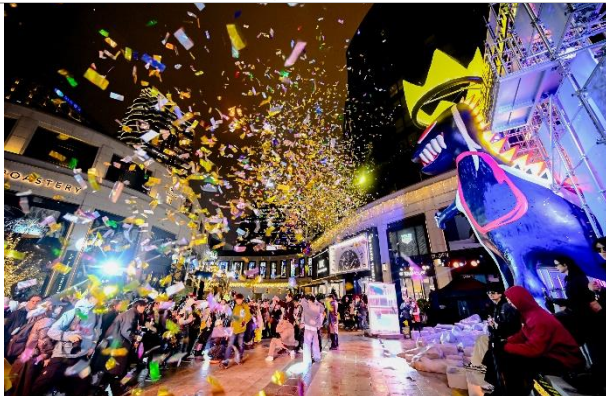
HKRI Taikoo Hui presented a large-scale public art installation “Pez”, a collaboration with the Jean-Michel Basquiat Foundation