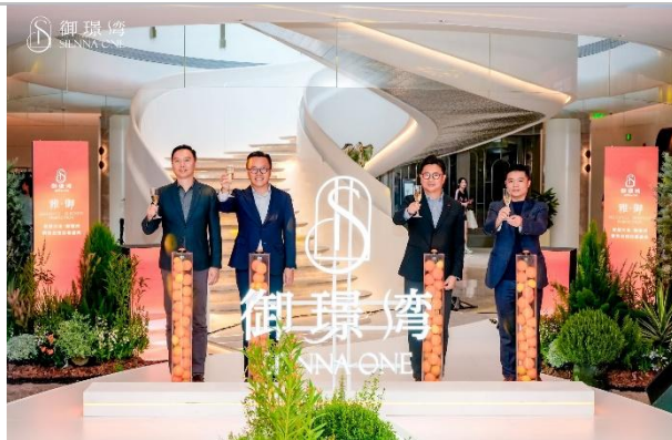
“Sienna One” , HKRI’ s sixth residential development in Jiaxing, has launched sales